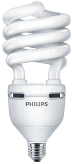
45.0 W;E27 ;Spiral