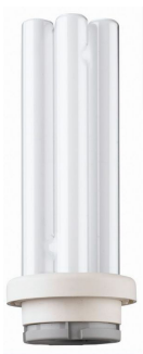
14W, GR14q-1, 4P