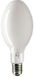
HPI Plus, E40