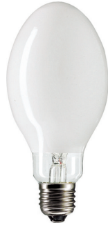
SON H, E27