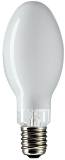
SON H, E40