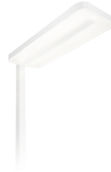
SmartBalance FFS DPP