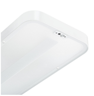
SmartBalance FFS DPP