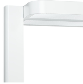
SmartBalance FFS DPP