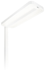
SmartBalance FFS DPP