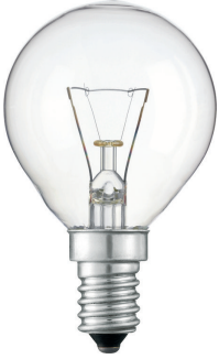
E14, P45, Clear