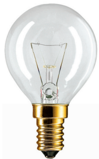
E14, P45, Clear