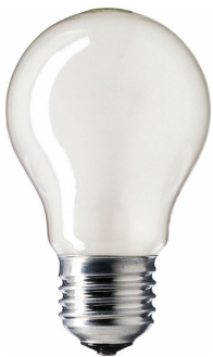
E27, A55, Frosted