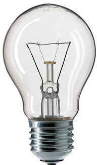
E27, A55, Clear