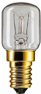
E14, T25, Clear