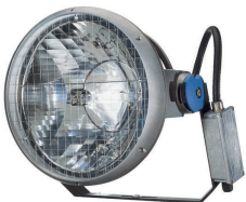
ArenaVision MVF403 sports flood-lighting luminaire