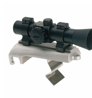
Precision aiming device