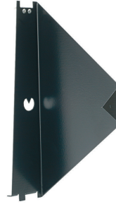
Simple aiming device