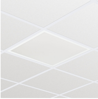
SlimBlend recessed mod. 600