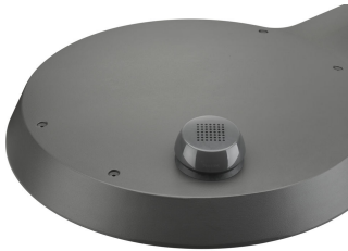
TownTune ASY BDP265