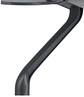
TownTune LYR BDP270