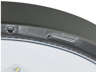
TownTune ASY DR BDP266