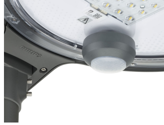
TownTune ASY BDP265