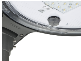
TownTune ASY BDP265