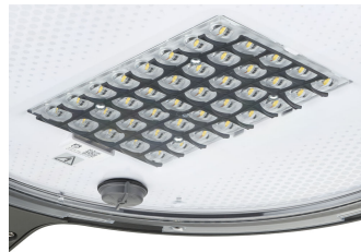
TownTune ASY BDP265