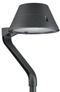
BDP272, TownTune Lyre with decorative top cone and clear decorative ring