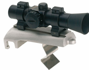
Precision aiming device