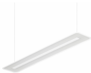
SmartBalance suspended SP480P luminaire, direct lighting