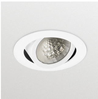
LuxSpace Accent Fresh Food RS741B adjustable spotlight with LED light source, compact version