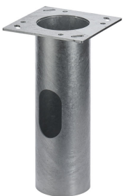
OPTISPACE BOLLARD ACC.