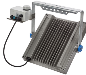
InterAct ready version