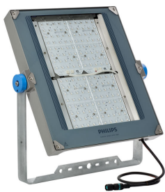
CORELINE TEMPO X-LARGE - LED module 48000 lm - 740 neutral white - Optiflux asymmetrical axis angle 52°